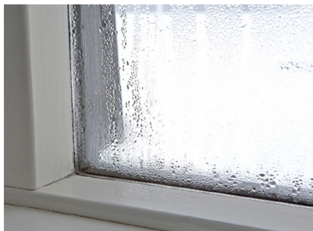
Condensation is a normal occurrence