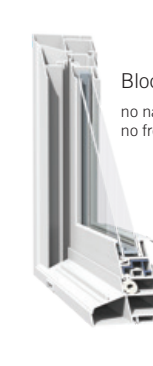
Block Frame no nail fin & no front flange