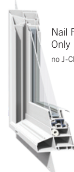
Nail Fin Only no J-Channel