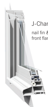
J-Channel nail fin & front flange