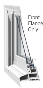
Front Flange Only