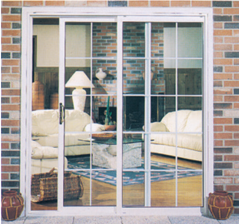
Optional brass handle shown here