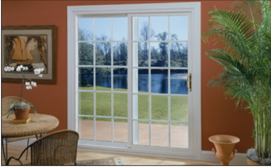
Optional brass handle shown here