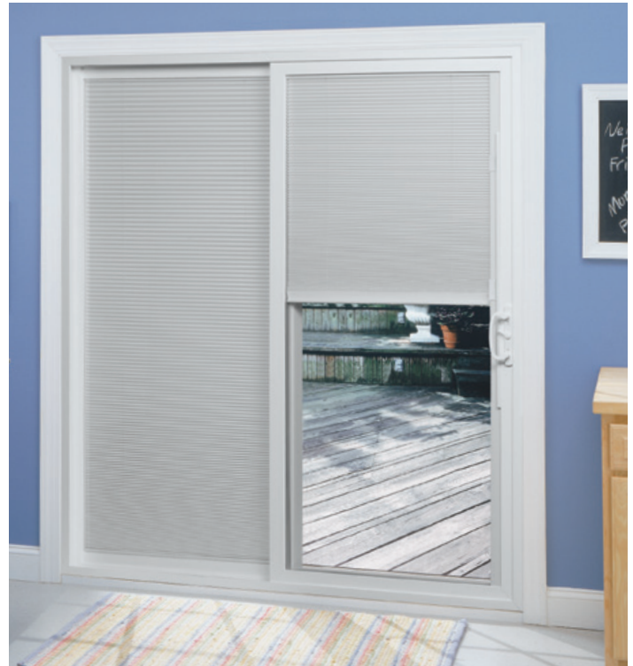
Model 312 door shown, feature also available in Model 332