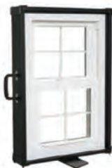
Marketing Support Table top sample window