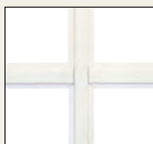
5/8" Contoured Grid