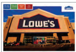
PSE Electronic Sales Tool