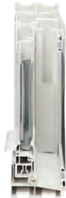
PSE 3500 DH

Compare the Difference: Two Great Windows with Distinct Benefits to Exceed Any Consumer's Needs!