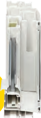
PSE 3900 DH