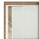
Controls light and privacy