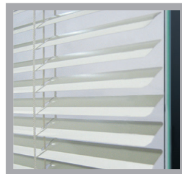
Never needs dusting and are safe for pets and children