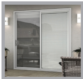
Sealed between the glass, blinds control light and privacy