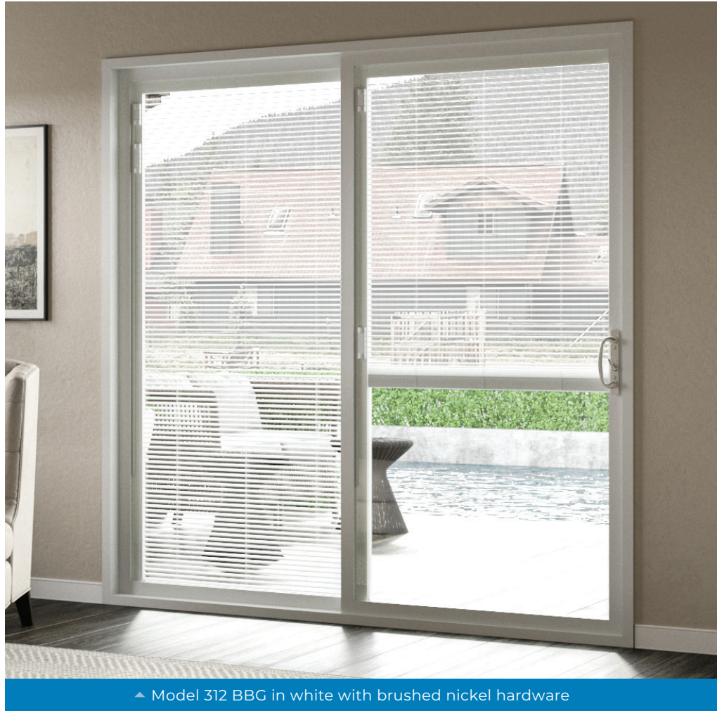
▲ Model 312 BBG in white with brushed nickel hardware