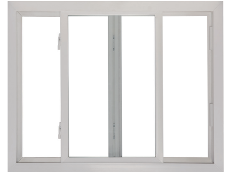
2-lite sliding window with front flange